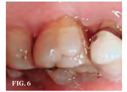
SYMPTOMS OF THE TRIAD (4.) Indentations on tongue caused by forceful pressing of tongue on lingual surfaces. By pushing the tongue anteriorly, the airway is opened. (5.) The red, irregular surface on the palatal surface of a maxillary molar can be an early sign of reflux. (6.) Continued damage from erosion produced by GERD Other areas of erosive damage will be dictated by the sleep posture of the patient.

increases with an increase in sleep apneainduced arousals. ^{22,33}\mathrm{At} least one third of patients with bruxism in the general population may also have sleep-disordered breathing conditions such as sleep apnea, periodic leg movement during sleep, and headache.<sup>22,34</sup> The rate of OSA may be as high as 30% in a TMD population. (18, unpublished data) In addition to OSA, close to 50% of UARS patients complain of bruxism.<sup>22</sup> Prospective evaluations and case studies of SB and apnea indicate that bruxism events may be directly correlated to apnea episodes.35 While a causal relationship cannot be made, obstructive sleep apnea (OSA) syndrome has been called the highest risk factor for tooth grinding during sleep.36