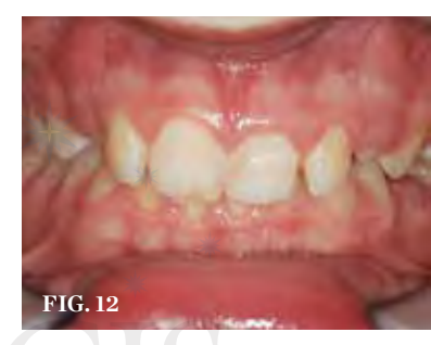
RECOGNIZING TRIAD PATIENTS (10.) Extensive wear on stabilizing splint. It has been postulated that continued bruxism on splints is pathopneumonic for the bruxism triad. (11.) Continued wear on splints is indepen dent of the design of the prosthesis (12.) Childhood presentation of the bruxism triad. Patient had erosive and attritional wear on deciduous teeth, constricted dental arches, and deep class II bite. Physician examination revealed significant GERD paired with enlarged adenoids and tonsils.

Bruxism is greatest in 5- to 6-yearolds and slowly declines with age. Adenoid tonsil hypertrophy in the 5- to 6-year-old patient may account for the airway obstruction and, thus, a greater incidence of bruxism.28 As the airway improves with age, the bruxism decreases in the general population but in the triad group it continues. If bruxism is a reflexive mechanism to improve or protect an airway, then greater bruxism could lower the apnea. Sjöholm concluded that there is limited correlation between bruxing and apnea because mild apnea patients had more bruxing events than moderate apnea patients.38 However, if bruxism is a protective reflex, clinicians might be able to predict the possibility in a young patient population that bruxism would be linked to less severe apnea. Aggressive bruxism