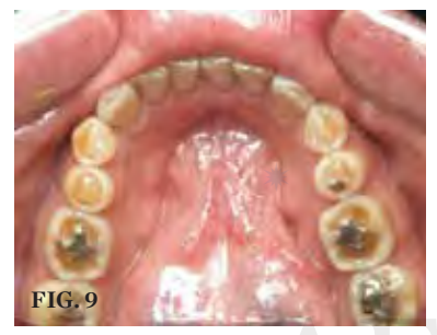
RESULTS OF THE TRIAD (7.) Patients who combine tongue pressure to clear the airway and GERD can produce wear on the lingual surfaces resembling bulimia. It is not restricted to maxillary anteriors. (8.) Young adult with signs and symptoms of the bruxism triad: Lateral tooth wear, erosive and abrasive damage to the teeth, and a history of moderate apnea. (9.) Extensive erosive wear. Airway improvement can reduce GERD and GERD resolution can reduce sleep bruxism.

episode. The majority of SB episodes occurs in a supine position and may be associated with either a reduction in the airway passage or increase in its resistance. During resumption of ventilation following apnea, a co-activation of both jaw-opening and jaw-closing muscles produce dilation of the upper airway. This permits a rise in inspiratory flow and reduces upper airway resistance.37 It has been reported that 99% of all rhythmic masticatory muscle activities were associated with a change in the respiratory amplitude and frequency.19 Changes in lateral tongue contours, long associated with nocturnal bruxers, can now be explained. The patient attempts to provide a patent airway by activating the tongue muscles and forcing the tongue off the airway and against the teeth (Figure 4).